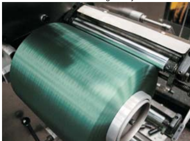
State-of-the-art manufacturing facility