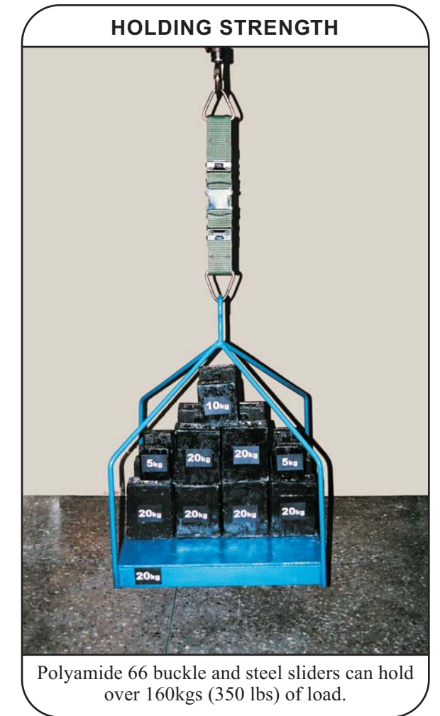
Polyamide 66 buckle and steel sliders can hold over 160kgs (350 lbs) of load.